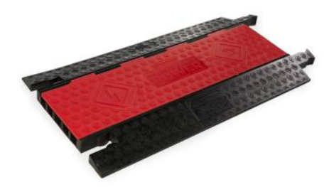
TEN47 CABLEGUARD 5 CHANNEL RAMP