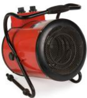
3KW RED BARREL HEATER

We have electric blown heating options from 13amp to 32amp.