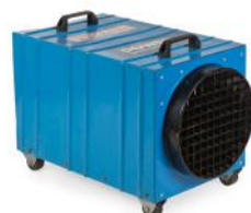
18KW 3 PHASE BLUE HEATER