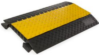
ADAM HALL DEFENDER MIDI

We boast bulk quantities of 5 channel cable ramp sourced from Adam Hall and Ten47. This is available in black with yellow or red lids. The heavy duty rubber end mouldings interlink to provide continuous cable protection.