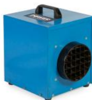
2.9KW BLUE SQUARE HEATER