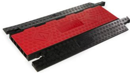
TEN47 CABLEGUARD 5 CHANNEL RAMP